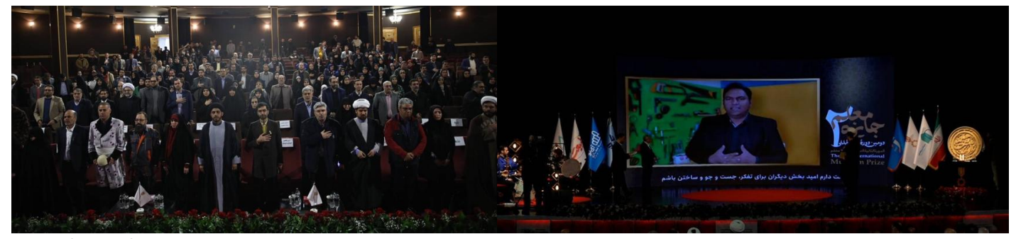
The funding for the Muallem Prize—including cash prizes, event expenses, and promotional activities—is provided through public contributions, sponsors, and benefactors who are committed to preserving and enhancing cultural standards in the country and the broader Islamic community, either through financial support or cultural endowments.

The Muallem Prize is an international, non-governmental award presented annually by the Borhan Public Foundation in Iran, in collaboration with the Iran Ministry of Education, and with the support of sponsors and benefactors including ECOSF. This award is dedicated to recognizing teachers and educators who have made outstanding contributions in education, training, or social impact.